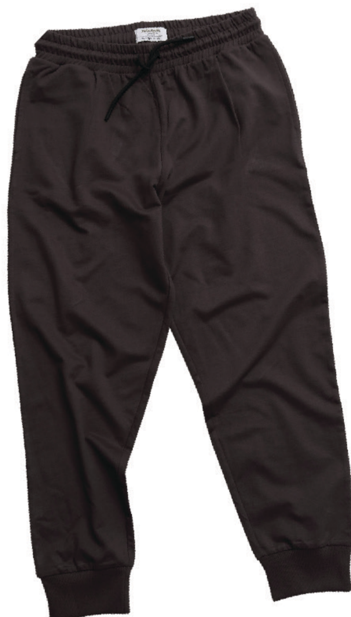
JUJUTSU KAISEN Jogger Pants (Assorted) RM99