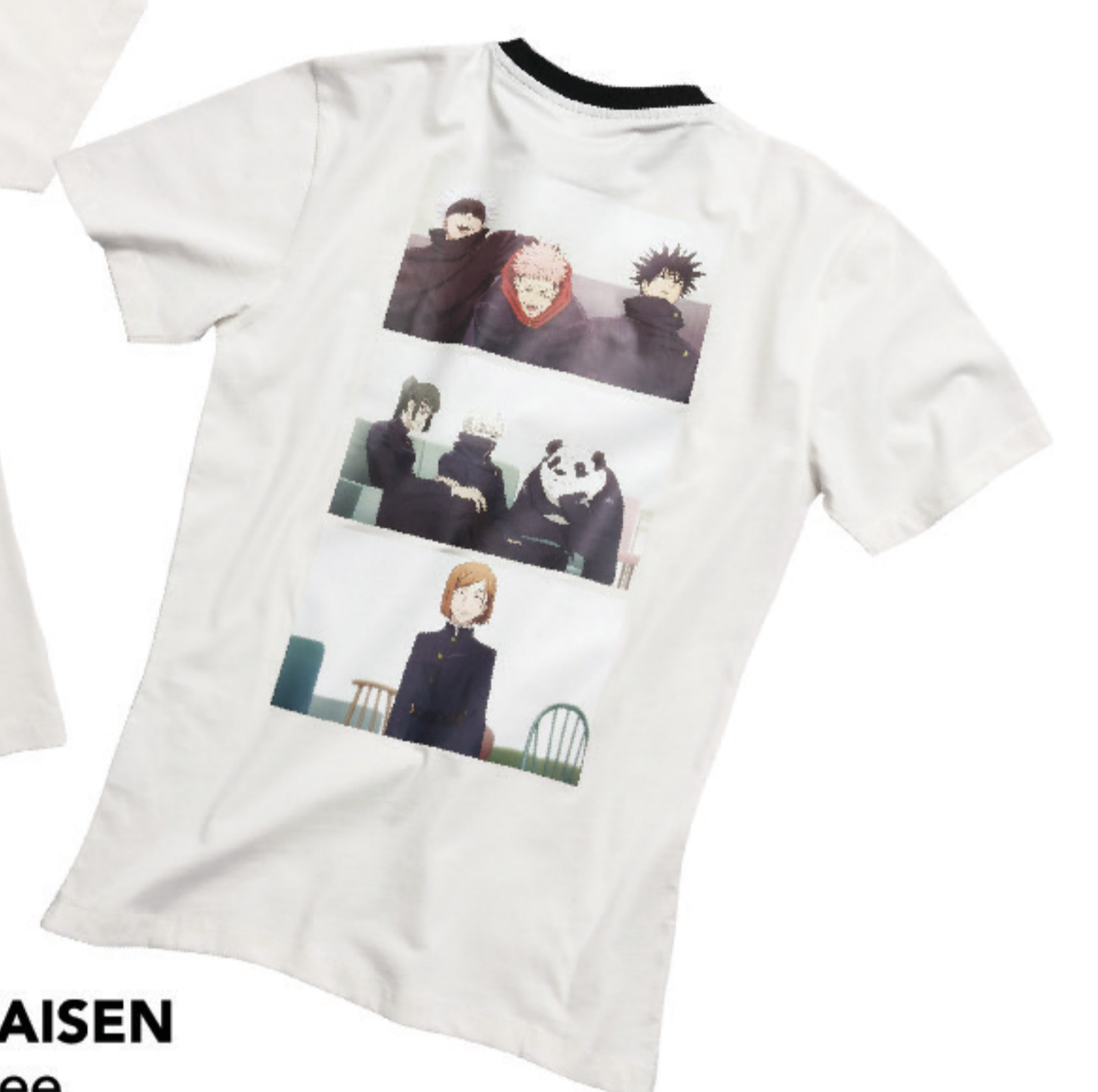
JUJUTSU KAISEN Oversized Tee RM59.90