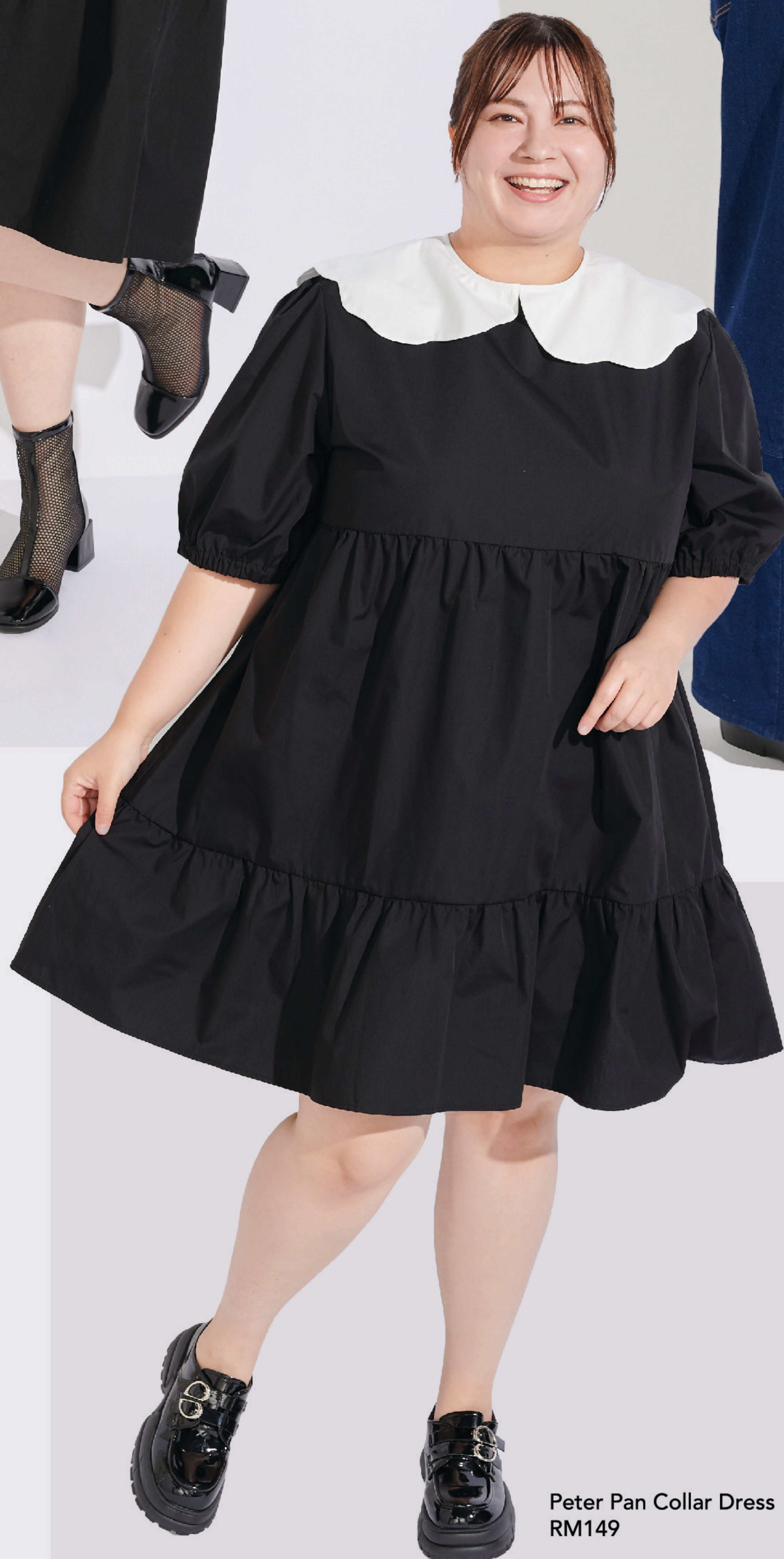
Peter Pan Collar Dress RM149