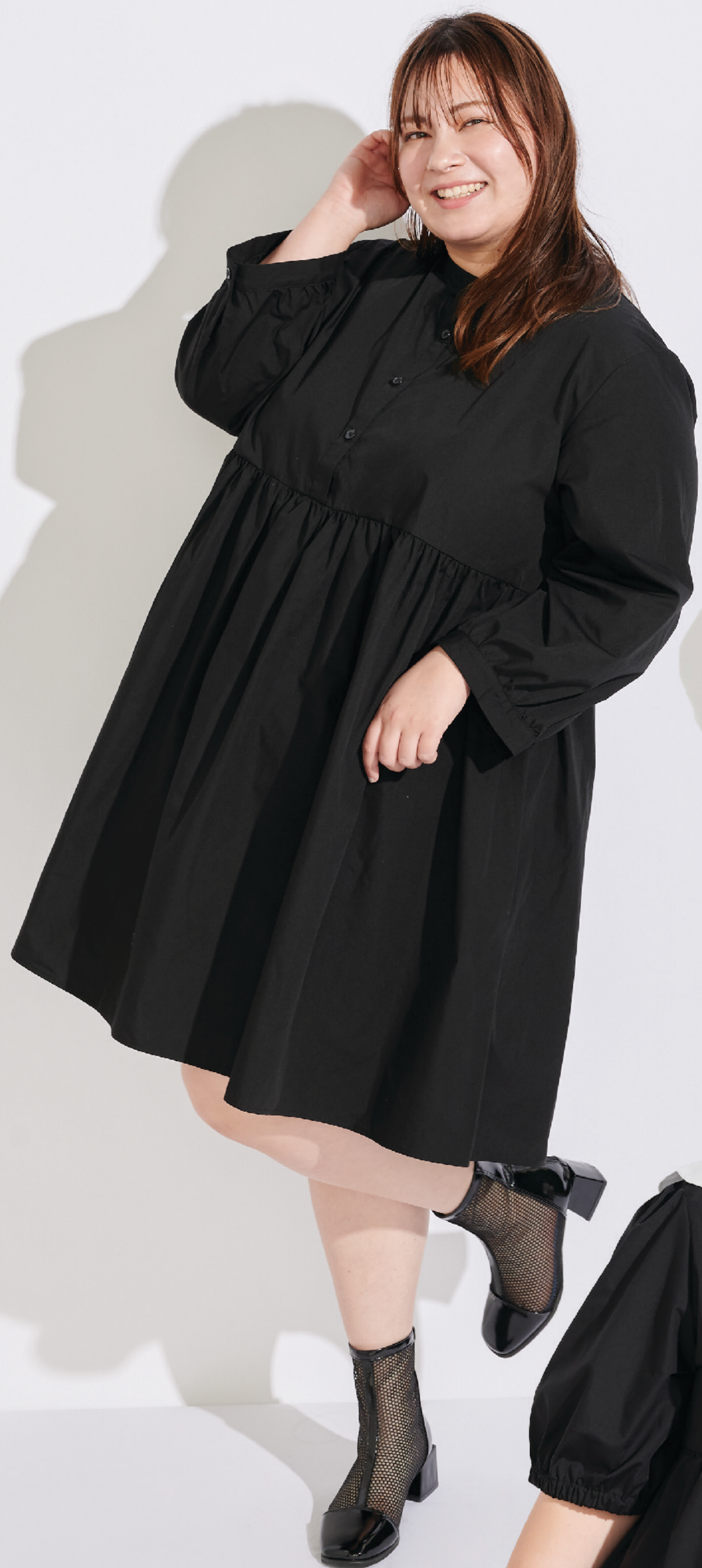
Gather Waist Dress RM139