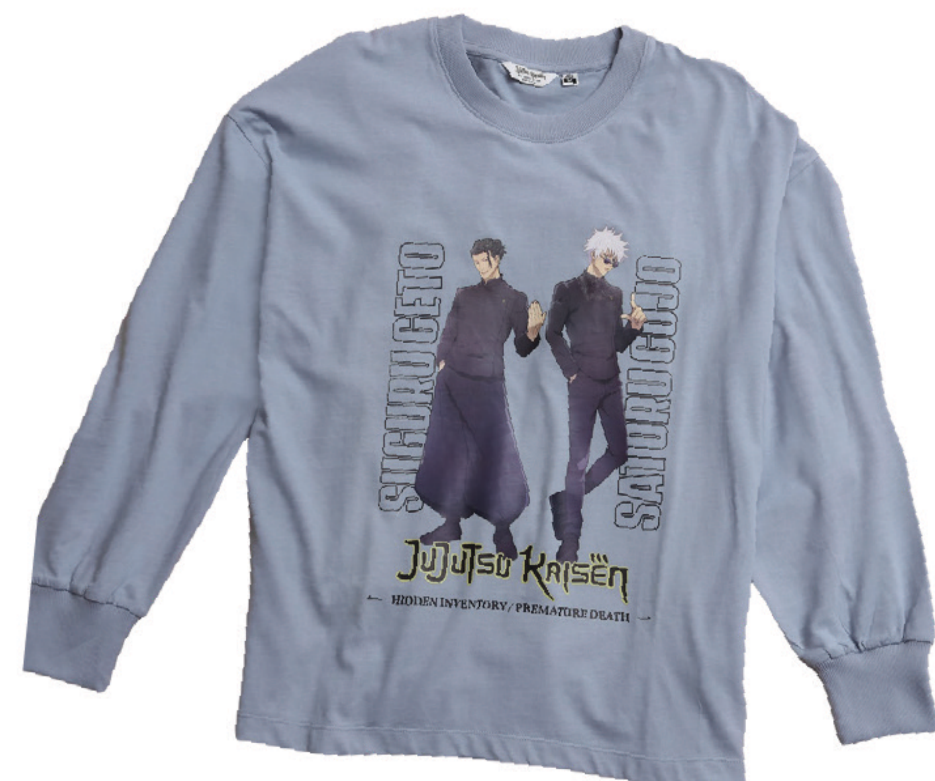
JUJUTSU KAISEN Long Sleeve Oversized Tee RM79