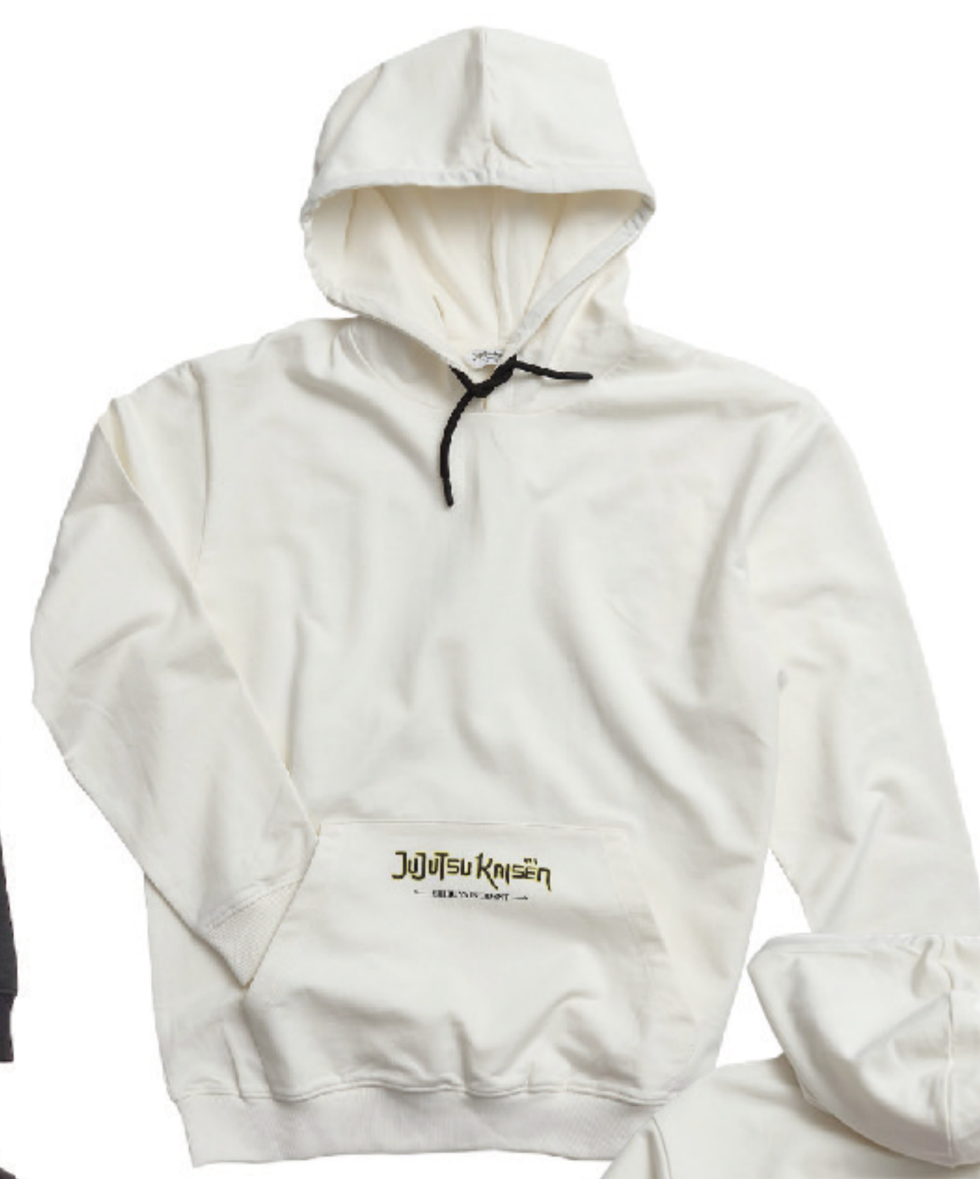
JUJUTSU KAISEN Hoodie (Assorted) RM119