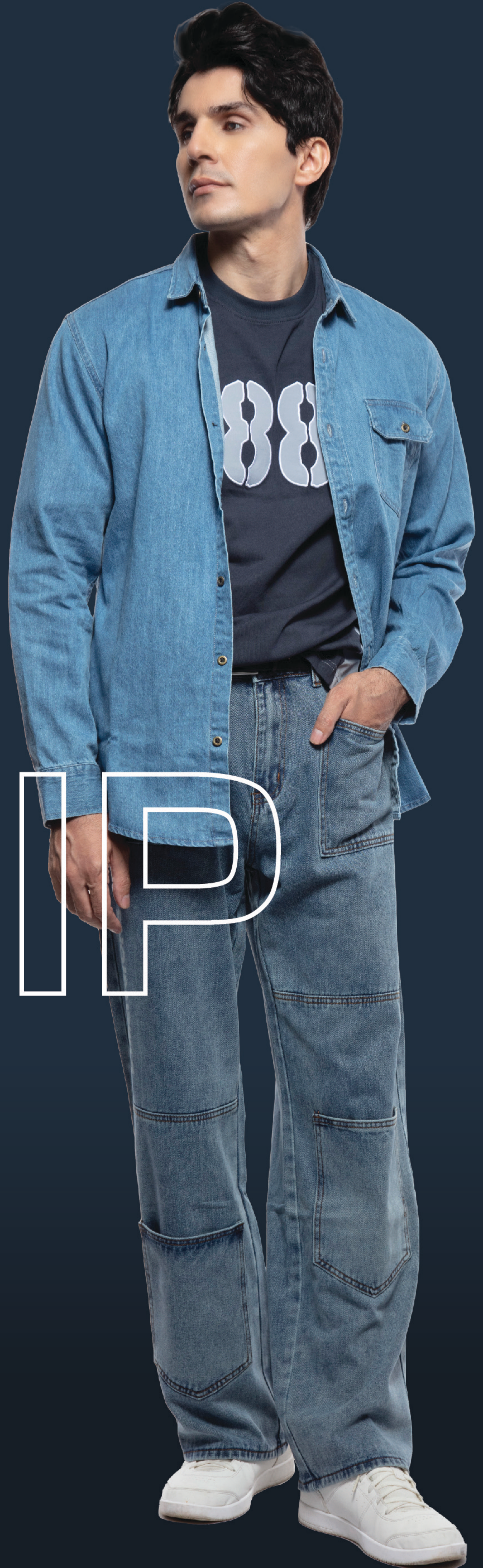
Top: Denim Long Sleeve Shirt RM69