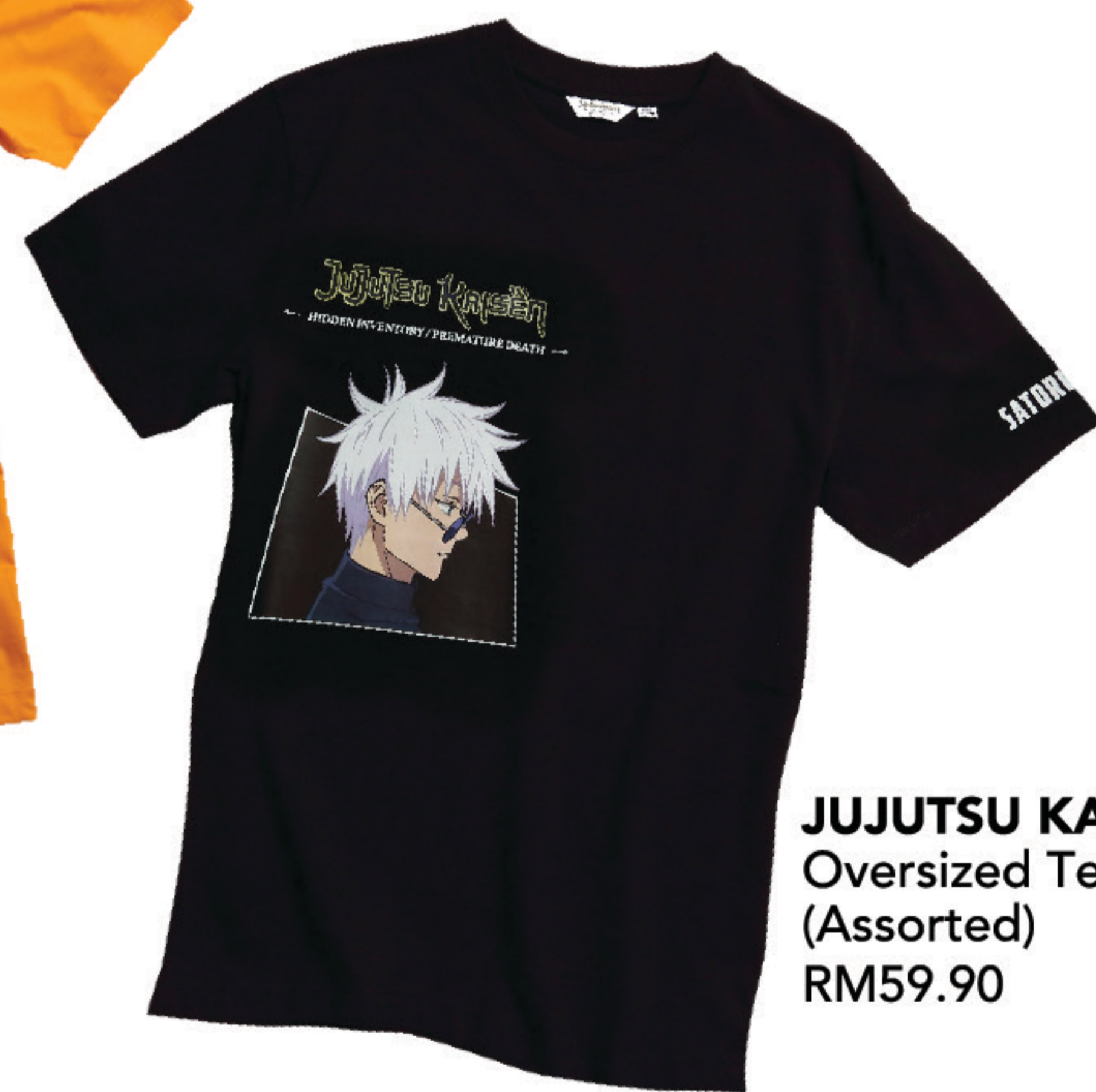
JUJUTSU KAISEN Oversized Tee (Assorted) RM59.90