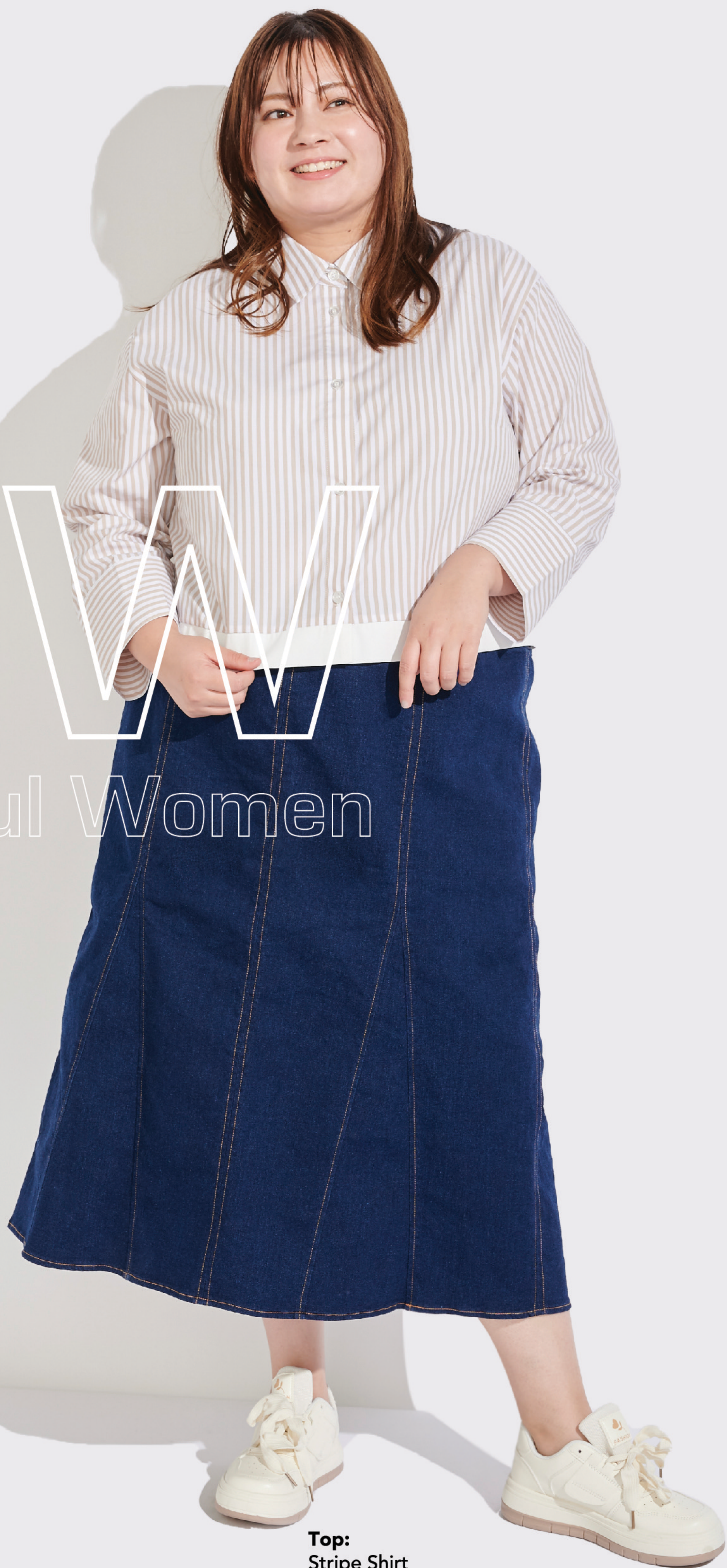
Top: Stripe Shirt RM109