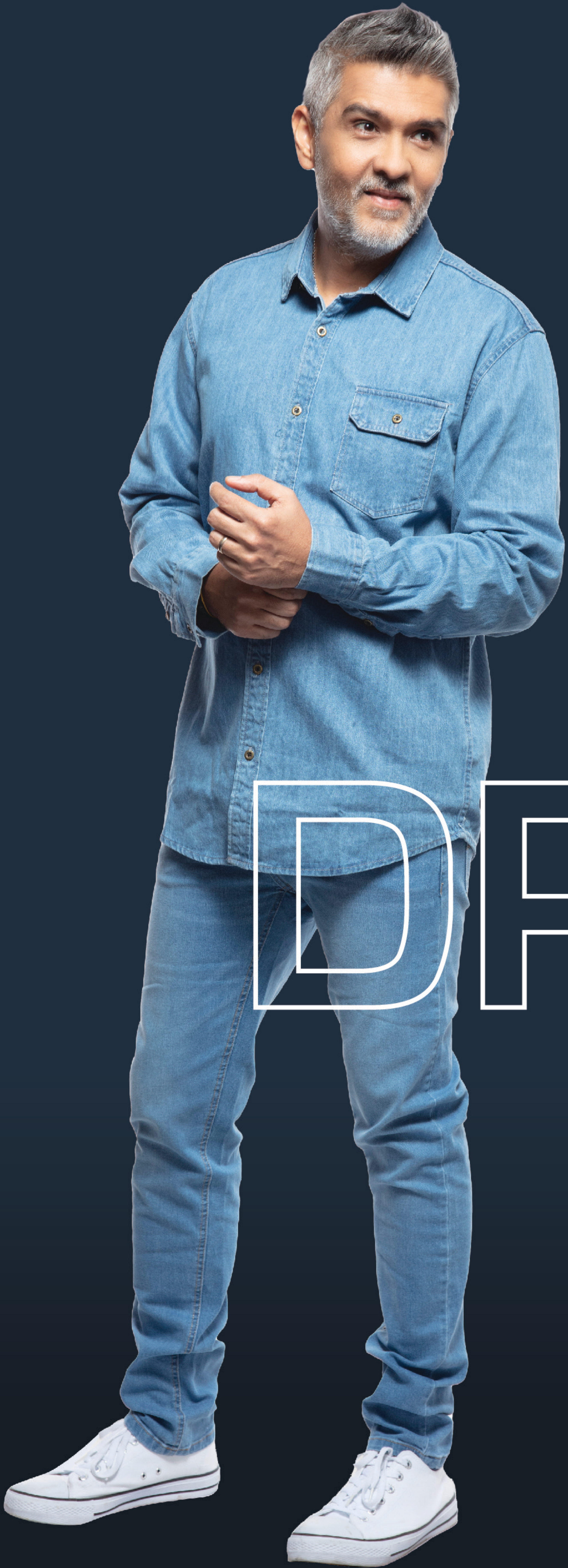
Top: Denim Long Sleeve Shirt RM69