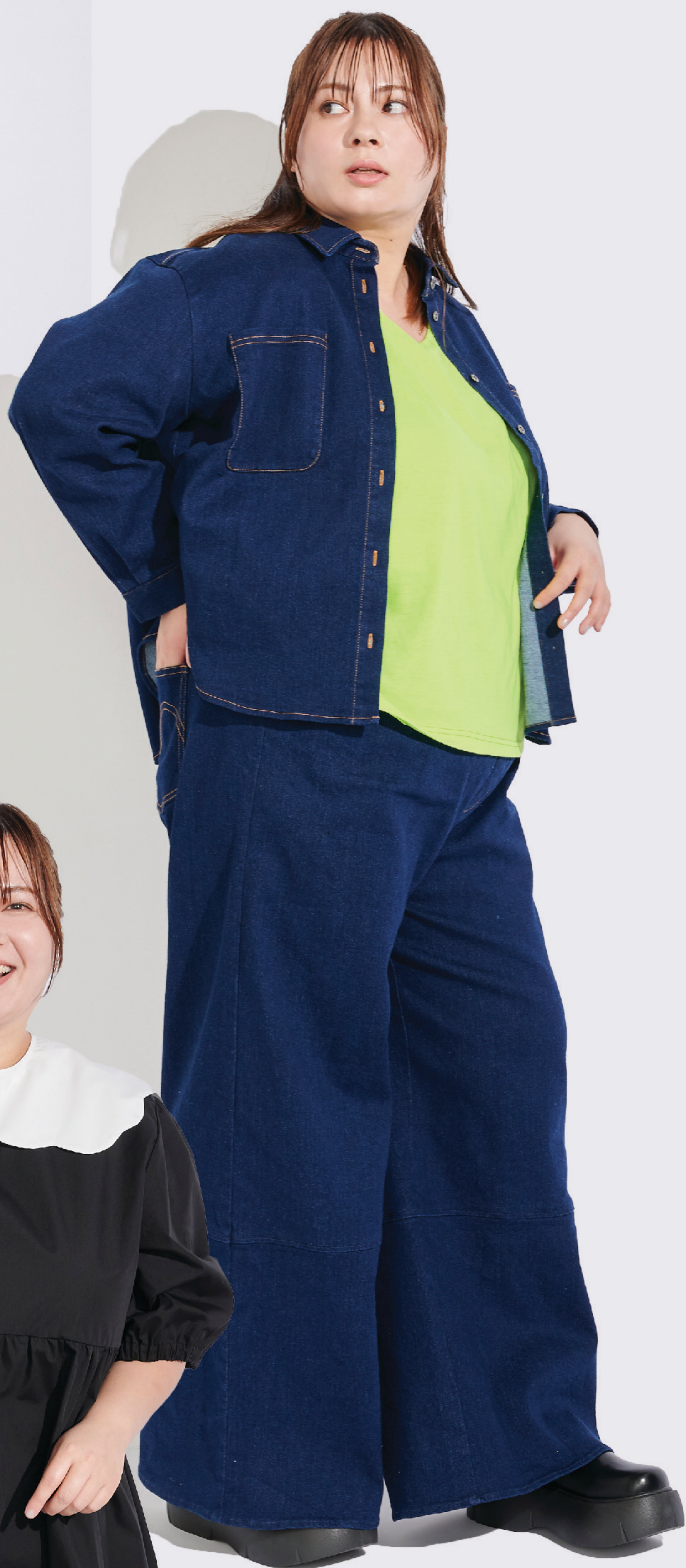
Top: Denim LS Shirt RM139